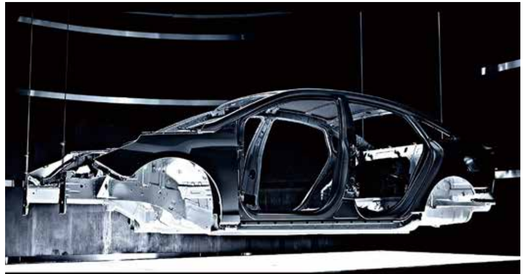
Technology from Automobile industry. Material from automotive structure metal, advanced high strength steel.